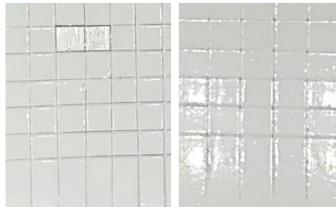
Aluminum Cold Rolled Steel 15 mil WFT, Cured 7 Days, Permacel Tape