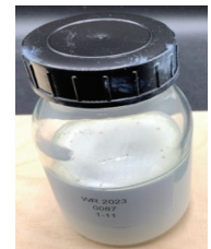
with 7% AOC E