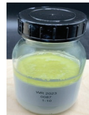
without 7% AOC E

(secondary drier that can also act as a thickener)